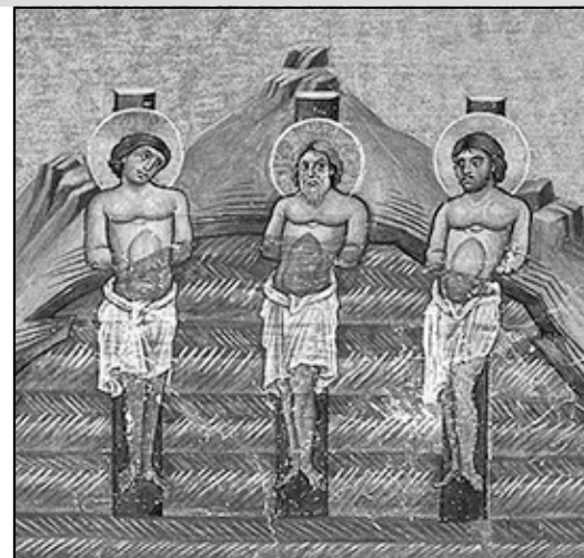
The three saints: Inna, Pinna, and Rimma

Tomorrow is the summer solstice. Do you know what that means? If you live in the northern half of the world, it's the longest day of the year. The sun shines longer that day than any other day of the year.