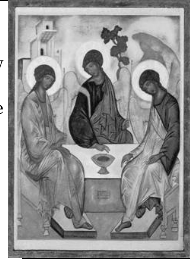
An icon of the Holy Trinity

Do you know what a routine is? It's the way you do something, especially when it's in a special order. You probably have a routine for how you get ready for school in the morning. First you get out of bed, then you get dressed, then you have breakfast, then you brush your teeth, and so on. Routines are good, because then we don't forget anything!