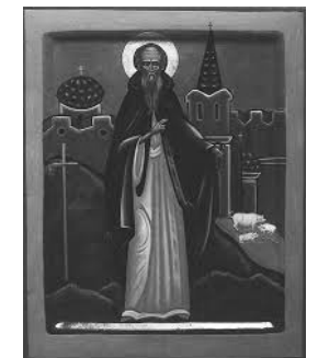
St. Brannock of Wales

He fought to keep icons in churches. He preached to the people of Georgia and Ukraine.