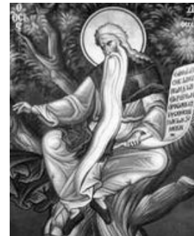
St. David of Thessaloniki, Greece

Let's look at just some of the saints for today—Sunday, June 26th! They lived at different times, and they all had very different lives...but they all had something in common. Do you know what it is? They loved God more than anything and anybody!