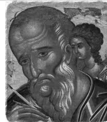
Saint John with an angel

Have you ever given somebody some good news? That you were having ice cream for dessert? That school was cancelled? It feels great to spread good news.