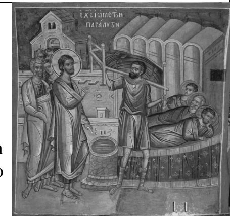
In the Gospel reading, we hear about the paralyzed man Jesus healed.

Today, we hear about two different stories. In the Gospel reading, we hear about a man who was paralyzed—he couldn't walk. Our Lord, Jesus Christ, saw this man and took care of him. He healed him and let him walk again.