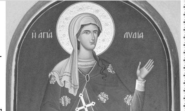
You can find this icon of Saint Lydia in the church named after her in Philippi, the town in Greece where she lived.

You probably became Christian as a baby , when your parents took you to church to be baptized. Maybe your parents became Christian when their parents took them to church to be baptized. And probably, so did their parents!