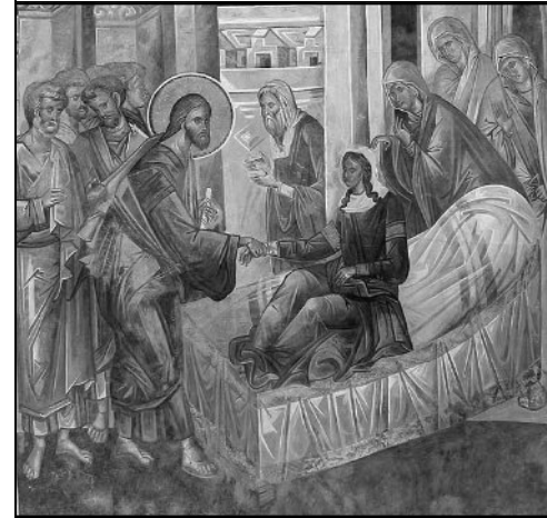
People laughed at Jesus, but He brought the young girl back to life!

Has anybody ever laughed at you? Not with you, but at you? Sure! We all do things that are silly. But today in the Gospel reading, we hear about some people who laughed at our Lord, Jesus Christ! Can you imagine?