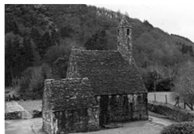
The little chapel of Saint Kevin, in Glendalough, Ireland today

monks at this monastery. If you visit Ireland someday, you can even see where the monastery was!