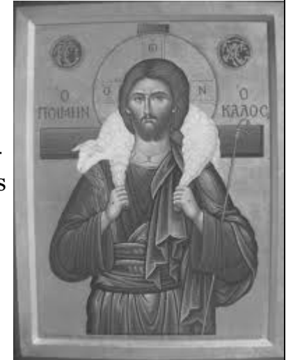
Jesus watches over all of His sheep!

Do you pray to God sometimes, all by yourself? Before Christ was arrested and sent to the Cross, He prayed by Himself too. In today's Gospel reading, we hear how He prayed to His Father for His disciples. Remember, the disciples were Jesus's great helpers. Now that Jesus was going to leave, He needed His disciples to keep working.