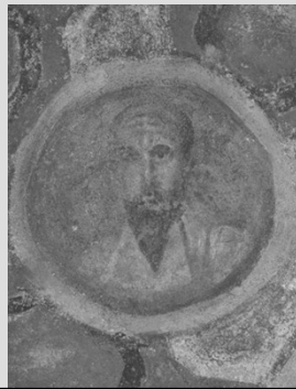
around 1,700 years

Did you know archaeologists have found pictures of this great saint from 1,700 years ago?