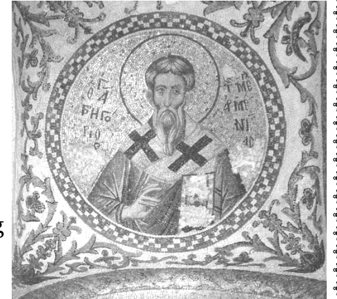
Saint Gregory of Armenia

Sometimes saints' lives are filled with wild adventures!