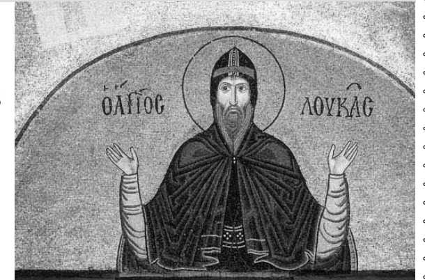
A beautiful mosaic of Saint Luke the Righteous

We’ve all seen beautiful icons, but you can find some of the most amazing ones in the whole world at a monastery in the middle of Greece. This monastery is called “Osios Loukas,” and it is named after St. Luke. (This is a different saint than the one who wrote one of the Gospels. This saint was born in 896, about 1,100 years ago.)