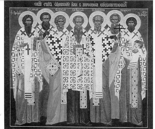
Saints Basil, Ephraim, Eugene, Elpidus, Agathadorus, Aetherius, and Capiton

These seven saints were some of the bravest you'll find. They are brave because they knew they had a dangerous job, but they happily did it anyway!