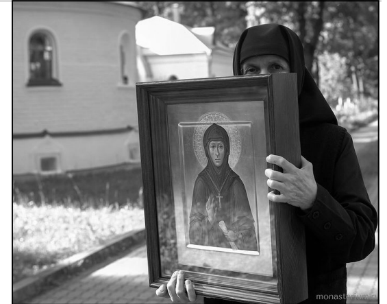
A nun holds a new icon of Saint Fomar, because she was just declared a saint

Have you ever met a saint? Maybe. Sometimes we might think of saints as living many, many years ago. But saints are alive among us today. That's because people who love God very, very much are around us today!