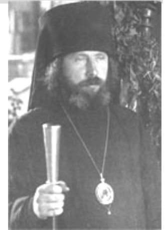
A photo of Saint Jonah

Have you ever felt sorry for yourself? Maybe you had a bad day. Maybe you have problems at home or at school. Maybe you felt sorry for other reasons, too.