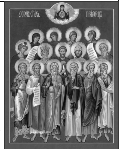
The Holy Forefathers were ready!

This time of year, we have lots of things to do that help us get ready for the big holiday! Your parents are probably busy getting ready too. Those things are fun, but sometimes we forget to get ready for Christmas in the right way.