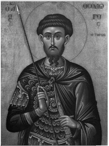
St. Theodore the Recruit