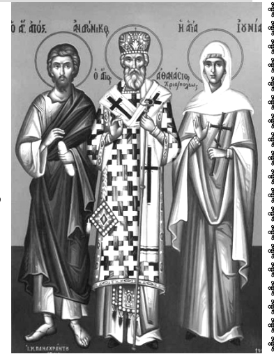
Here are Saints Andronikos and Junia, along with Saint Athanasios, another saint of the day

But in the Bible, in the book of Romans we read what Saint Paul wrote about them: "Greet Andronikos and Junia, my relatives who were in prison with me; they are prominent among the apostles, and they were in Christ before I was." So we know that these two were sent out to tell about Christ, but they suffered for doing that. They even went to prison with Saint Paul! Our Lord asks us to go out to all the world and tell others about God. He really sends us out! So we can try to be faithful and brave apostles too...like these two saints!