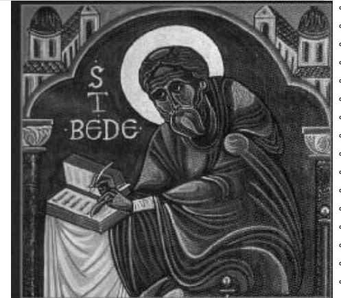
Saint Bede, called "The Venerable"

Do you study history at school? Do you learn about the presidents or about the founding of our country? Or about battles and soldiers from long ago? All of those things are important, and sometimes exciting! But did you know we have a lot to learn about our history of our Church, too?