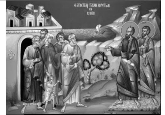
Saint Paul preaching with Saint Titus

Have you ever played a sport on a team? You probably had a coach who told you the plan. For example, if you played baseball, you might have heard your coach tell the team: "You play first base. You cover second. You play right field..." and so on. Your coach had a plan, and he wanted to make sure everybody played a part.