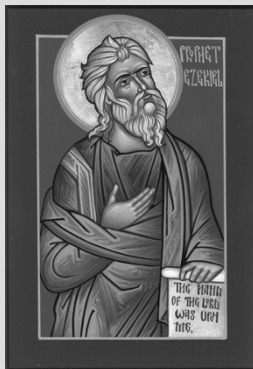
"The hand of the Lord was upon me."

It's a scroll, and it says something that you can find in the book of Ezekiel, in the Bible.