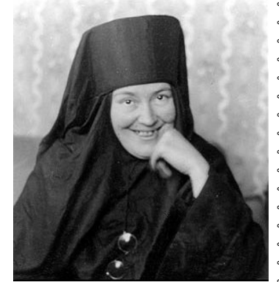
A photo of Saint Maria

Not too long ago (70 years ago, which isn't too long) all sorts of awful things were happening in Europe. A terrible war was going on, and lots of people needed help, especially in big cities in Europe like Paris. An Orthodox nun named Maria lived in Paris, and she became a saint because of the life she led there.