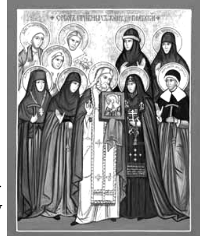
Saint Seraphim with the nuns of the Diveyevo Convent

In Russia, in a place called Diveyevo, there is a holy convent where the nuns pray very much. They especially pray to the Holy Theotokos, the mother of our Lord, and they try to grow closer to her.