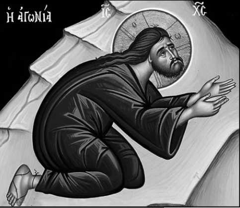
Christ praying to His Father

Do you listen to your parents? Always? Do you do what they want you to do? Always? Do you always try to make them happy? Always?