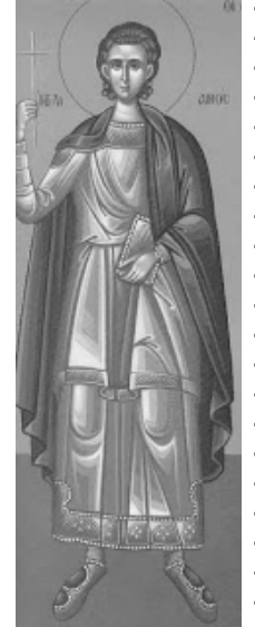
Our friend, Saint Julian

Do you share your name with somebody else? Probably. You might even have a kid in your class with your same name.