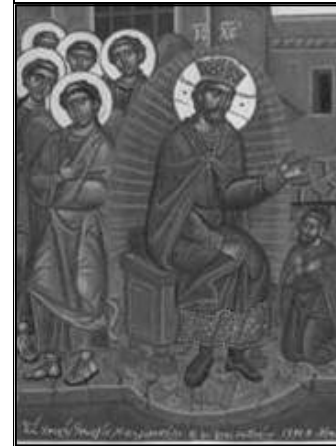
The Unforgiving Servant

What do you do when somebody gives you a present? Well, you probably say "thank you!" Then, you might try to repay that person with another present—maybe for a birthday or for Christmas. Sometimes, we might feel like we owe something until we've given something equal.