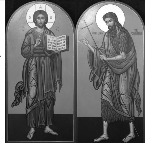
Saint John points to our Lord

Can YOU do that too? Can you give God the credit for things you have done?