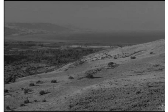
This is what the land of Zebulun looks like today.

Have you ever watched the sun rise? Maybe you woke up very early one morning, even while it was still dark out. You might have seen how the sun started to make everything light, even before you could really see the sun.