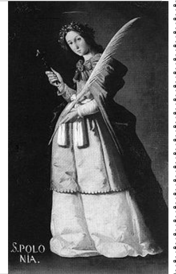
This is a painting of Saint Apollonia. It is in the famous art museum in Paris, the Louvre!

What would you do if you needed help with your math homework? Well, you'd probably ask somebody who knew a lot about math. But what would you do if you needed help making a cake? You'd probably ask somebody who was good at making cakes, wouldn't you?