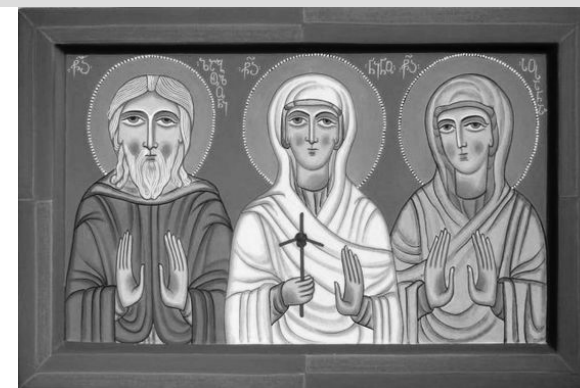
Saint Nina (in the middle) with her mother and father

about an athlete or a singer or somebody else with a great talent. We might wonder, "What made him so good at that?" Then, we might find out that his parents were great athletes too, or great singers, or something else! Our parents can help shape us into something great.