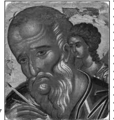
Saint John with an angel

Have you ever given somebody some good news? That you were having ice cream for dessert? That school was cancelled? It feels great to spread good news.