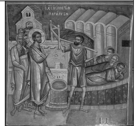
In the Gospel reading, we hear about the paralyzed man Jesus healed.

Today, we hear about two different stories. In the Gospel reading, we hear about a man who was paralyzed—he couldn't walk. Our Lord, Jesus Christ, saw this man and took care of him. He healed him and let him walk again.