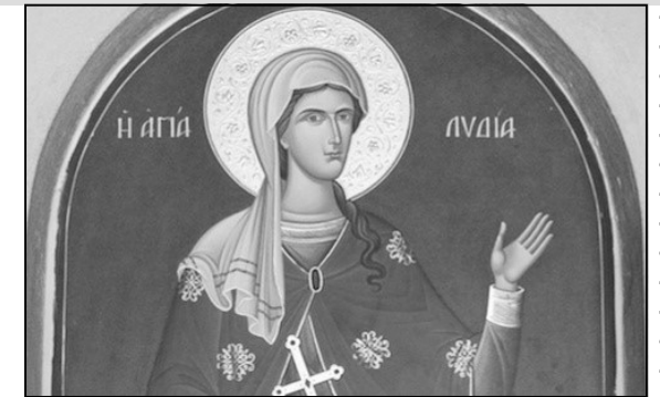
You can find this icon of Saint Lydia in the church named after her in Philippi, the town in Greece where she lived.

You probably became Christian as a baby, when your parents took you to church to be baptized. Maybe your parents became Christian when their parents took them to church to be baptized. And probably, so did their parents!