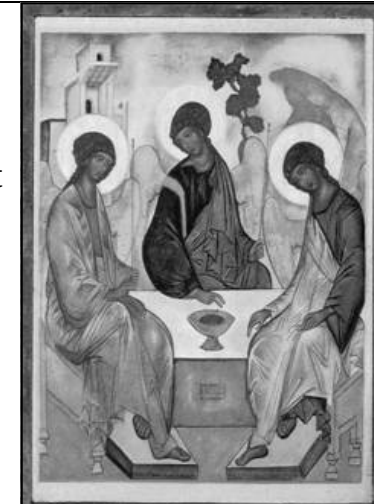
An icon of the Holy Trinity

In our prayers, we have routines too. First, we might say, "In the name of the Father, the Son, and the Holy Spirit. Amen." Then usually we say a prayer to the Holy Spirit. You know it, don't you? It