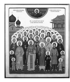
Martyrs of the Chinese Boxer Rebellion

This monk-priest saint lived all by himself in the forests of Russia, praying and growing closer to God. He died in 1445.