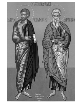
Apostles Bartholomew and Barnabas

Let's look at just some of the saints for today—Sunday, June 11th! They lived at different times, and they all had very different lives...but they all had something in common. Do you know what it is? They loved God more than anything and anybody!