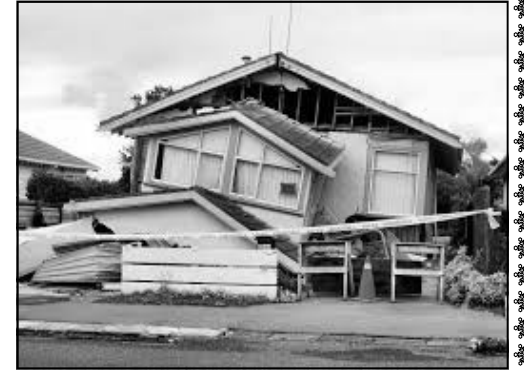
An earthquake is a scary thing!

Can you remember hearing about an earthquake? Or a hurricane? The awful Hurricane Helene hit the United States just this year. People are still cleaning up from the winds and the flooding. That hurricane destroyed lots of homes. The earthquake in Haiti hit 14 years ago. It was so bad that the people there still need our help.