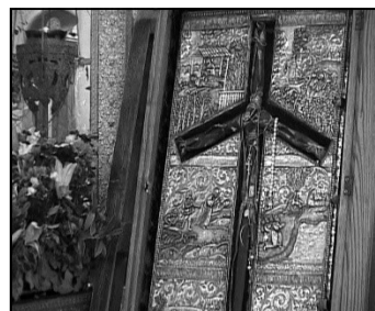
Here is St. Nina's holy cross made out of vines. You can even visit it in Georgia!

Once the rulers became Christians, the faith really took off in Georgia. Saint Nina is called the "enlightener of Georgia" because she brought the light of Christ to this country!